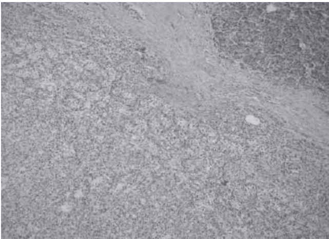
Fig. 3. Microscopic picture of renal cell carcinoma metastases in pancreas.

suspected on any abnormality noted in kidneys on imaging in the presence of metastatic lesion in pancreas. When metastases are limited to the pancreas, surgery can provide 31.0% 5-year survival rate. The lesions are multifocal in 30.0% of patients and resectable in 80.0% of cases. Overall there is an excellent prognosis for RCC patients with surgical resection of pancreatic metastases depending on their general state of health. 9