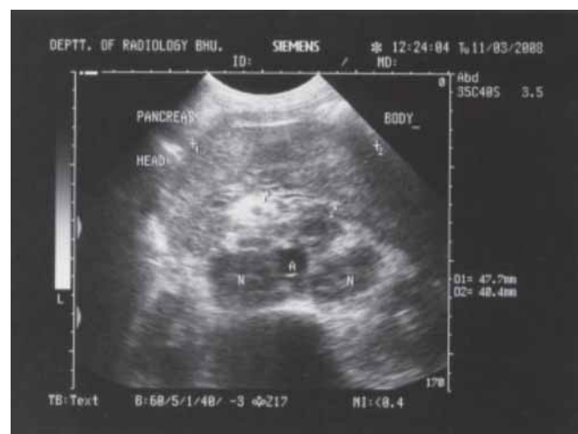
Fig. 2. Abdominal Ultrasonography: Renal cell carcinoma metastases in pancreatic head.

Metastases in pancreas are suspected on the CT appearance of hyper-vascular lesion and should be further evaluated with endoscopic sonography and biopsy. A primary tumour of renal cell origin should be