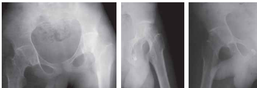
Fig. 7. Pelvis with both hips AP and bilateral hips lateral view: shows tilted pelvis, reduced and incongruent hip joint spaces with malunited femoral physis, widened neck and tilted femoral head along with visible physeal scan on both sides.

The most important priority in the management of a patient with a SCFE is to prevent progression of the slip and avoiding the complications of avascular necrosis and chondrolysis. 37 The current treatment methods for a patient with a stable (chronic) SCFE include: (1) immobilization in a hip-spica cast 38 (2) in situ stabilization with single or multiple pins or screws 39,40 (3) open epiphyseodesis with iliac crest or allogeneic bone graft 41,42 (4) open reduction with a corrective osteotomy through the physis and internal fixation with use of multiple pins 43,44 (5) compensating base-of-neck osteotomy with in situ stabilization of the slipped capital femoral epiphysis with use of multiple-pin fixation 45 and (6) intertrochanteric osteotomy with internal fixation. 46